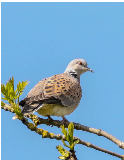
Turtle Dove – a pair returned to Marston Thrift from 28th

Swift – first reported at Meadow Lane/Priory on 23rd Sand Martin – 100 at Broom GP on 4th and c500 at Stewartby on 2nd and 4th House Martin – two at East Hyde on 1st, one Eversholt 2nd were first reported Swallow – odd singletons around on 1st, 2nd, 3rd were first reported